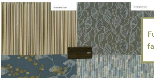
Furniture fabric options

One of the best components of our renovation project is our vision to create a warm, welcoming sense of home for our residents and families. Some years ago, we achieved this in our Assisted Living Tower. The photos above and below give you a sense of just how warm and home-like the Lodge will be after the renovations.