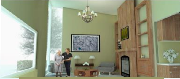
Artists' rendering - Fireside Lounge—West (Arbutus Wing)

Anyone walking into Hawthorne Lodge today knows how “institutional” the environment feels. That’s because the Lodge was originally built as an extended health care facility, back in 1994.